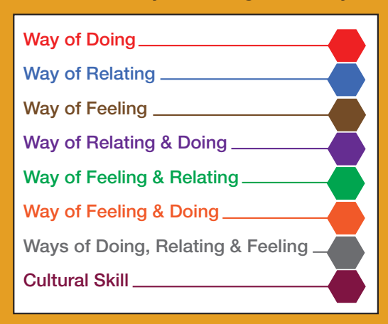
Table B shows the SEL domains coded into the Ways of Being model and provides the number of individual skills sorted into each domain. Seven of twelve SEL domains were categorized as exclusively one of the three 'ways of being'. Four do-

Participants detailed their intentional efforts to support SEL in youth through programming and experiences. Each identified skill, characteristic, or attitude was coded as either an SEL skill or a non-SEL skill. SEL skills were then coded into the Ways of Being model. Table A outlines the color key used when coding each SEL skill. After coding each individual SEL skill, as many skills as possible were collapsed into larger domains based on like concept/meaning. A total of twelve domains were identified during this process; they are listed with example SEL skills in Appendix A.